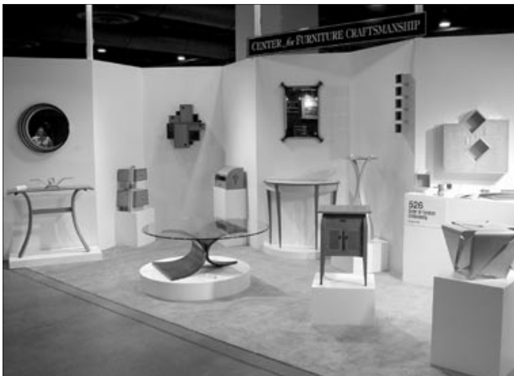
The Comprehensive students' booth at the Philadelphia show

enjoying lunch on the school's croquet pitch in the warm April sun. "It's been wonderful learning for me. And the students get more input and points of view than at any other place I've taught, by a long shot! Some of them will go on to do exceedingly well."