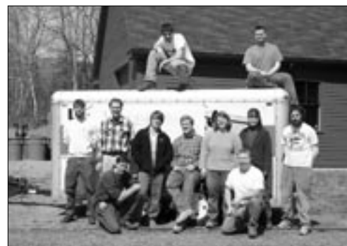
Nine-month Comprehensive students and instructor with trailer loaded for the Philadelphia Furniture and Furnishings Show.